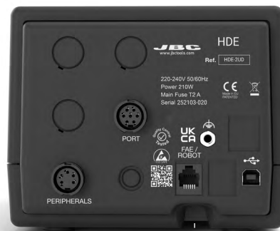
HDE Heavy Duty Control Unit

Power Cord (Included in HDE Heavy Duty Control Unit)